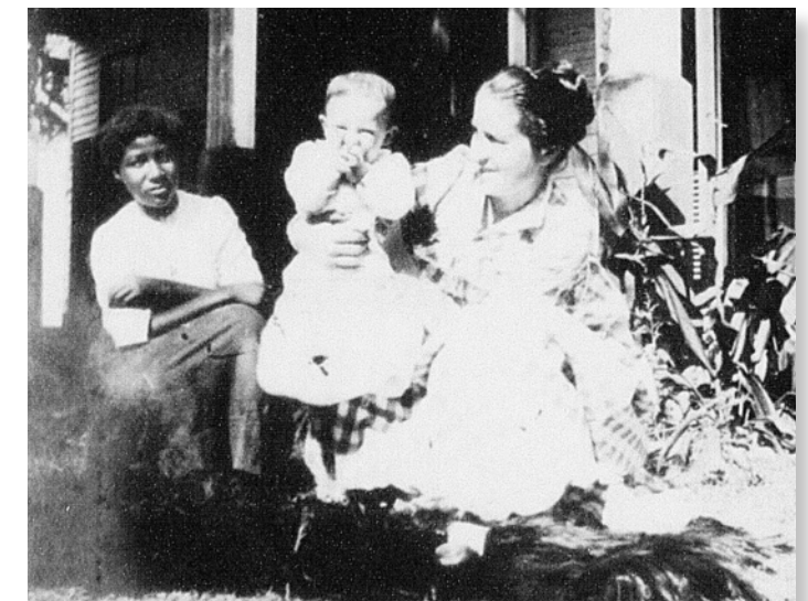
Photograph of women with child.