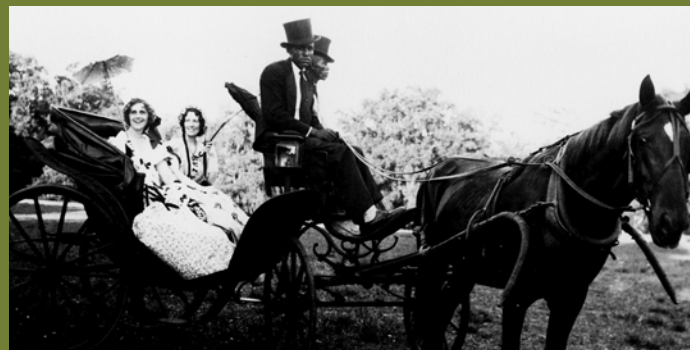
Women of Natchez Garden Club being driven in horse drawn carriage. From Joseph D. Shields photographs in Plantations Records, Part 1.

History Vault's collections on Slavery and Southern plantations candidly document the realities of slavery at the most immediate grassroots level in Southern society and provide some of the most revealing documentation in existence on the functioning of the slave system. Digitized ledgers, letters, papers, petitions, photographs, scrapbooks, diaries, judicial documents and other materials illuminate a unique view into this large and momentous chapter in history by documenting the far-reaching impact of slavery on plantations, the American South, and the nation.