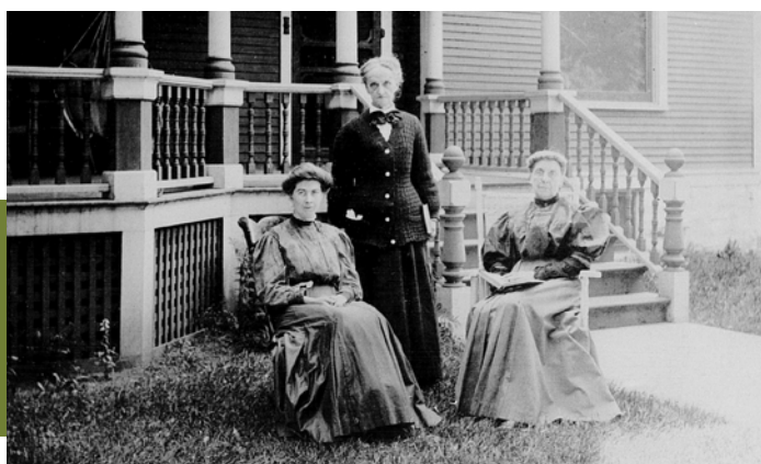
Women seated in front of manor. From Butler Family Papers in Plantations Records, Part 1.