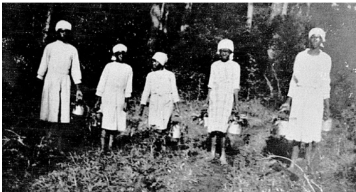
Photograph of child laborers in field.