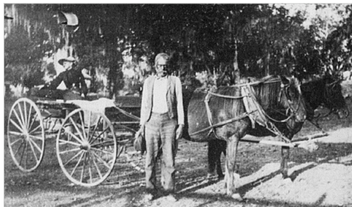
Man in front of horse drawn cart.